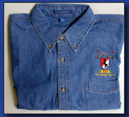
Dark Denim Shirt, w/BH & VN Ribbon $35.00