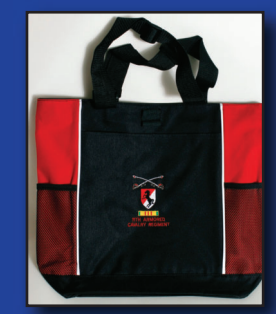
#16 Tote Bag. Embroidered $22.00