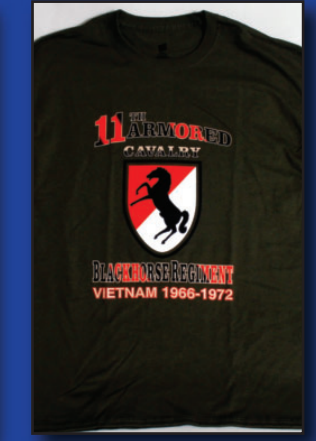
#39 a/b T-Shirt, Light Gray & Green $20.00