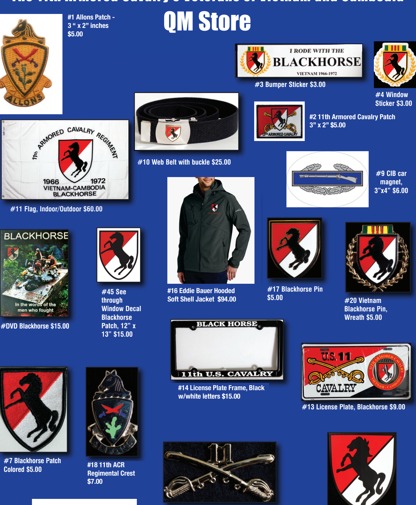
#26 Large Blackhorse Magnet 7 X 8 ½" $10.00

#12 "The Beast" Blackhorse Knife - It is a multi-purpose tool. $22.00