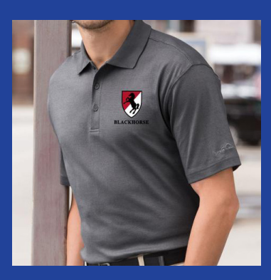
#27 Eddie Bauer Polo $32.00